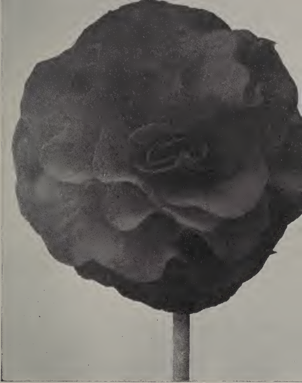
RED TRIUMPH Camellia Type Double